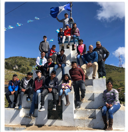
Kids from Casa